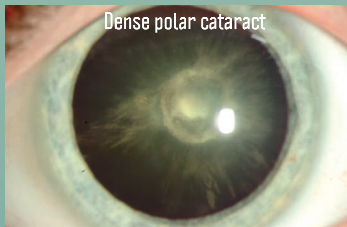
Dense polar cataract